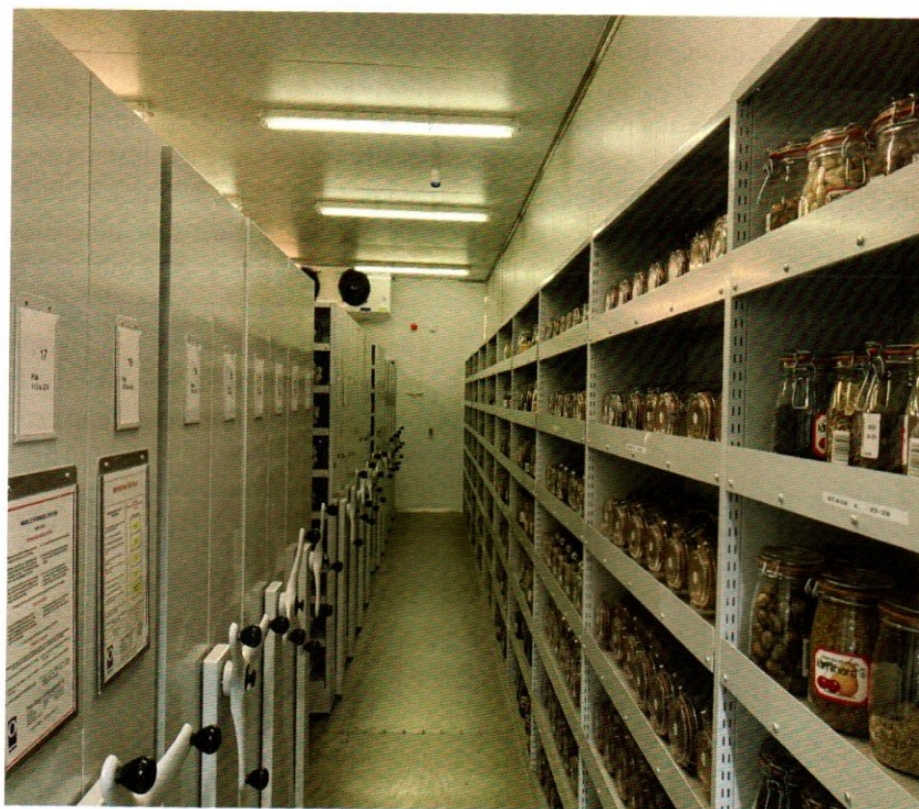
One of the cold storage vaults beneath the Millennium Seed Bank, where billions of seeds are kept at -20 degrees Celsius.