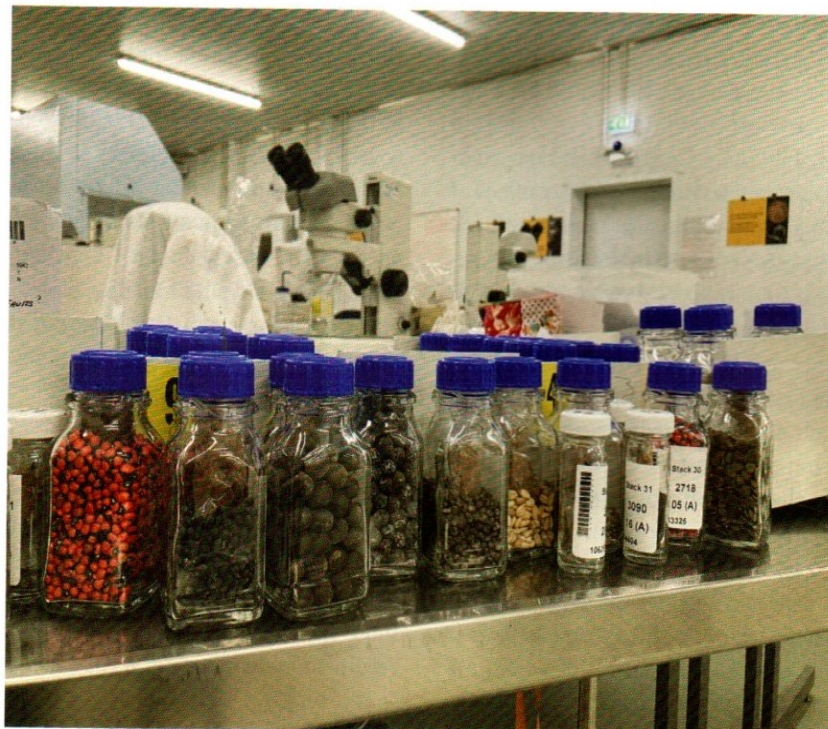
Seeds selected for test germination from the Millennium Seed Bank's storage vaults.