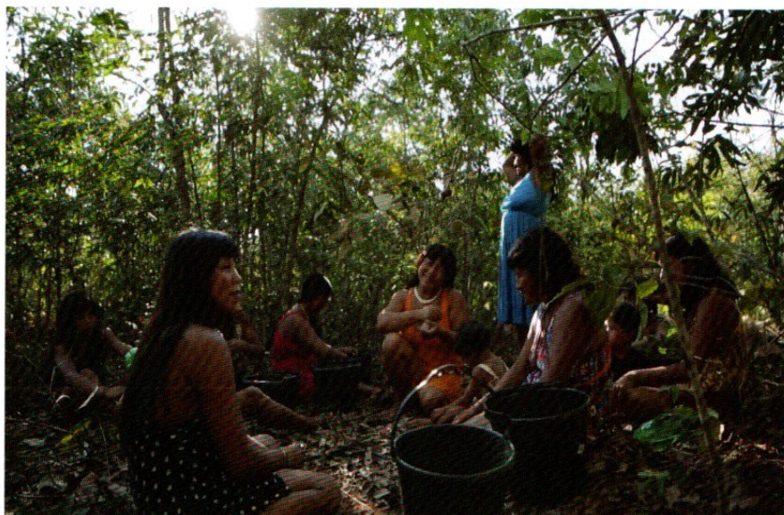
Seed collectors with the Yarang Women’s Movement, part of the Xingu Seeds Network, harvest tree seeds in Brazil that will be sold to companies for forest restoration.