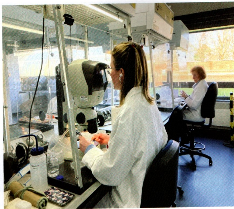
Scientists at the Millennium Seed Bank examine seeds under microscopes in the facilities' labs at Wakehurst botanic garden.