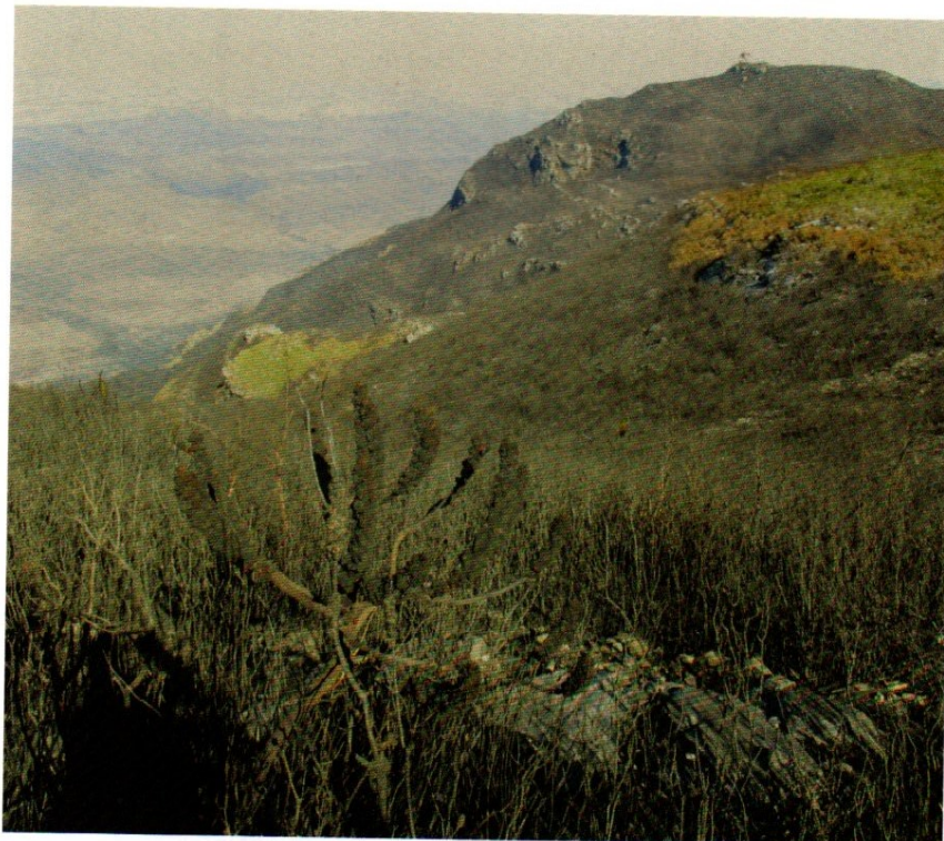
Scorched mountaintops in the Stirling Range, with burnt dryandras visible in the foreground. Wildfires have taken a heavy toll on some rare endemic plants in the park.

Gallagher says these field trips have shown that many species have indeed bounced back. Some thought to be at risk of