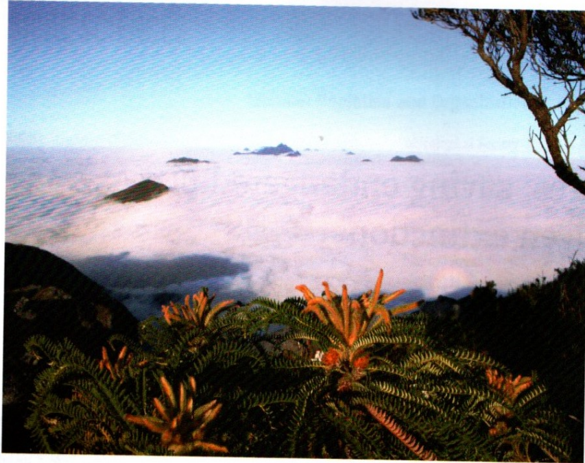
A Stirling Range dryandra ( Banksia montana ) high above the clouds in Western Australia's Stirling Range National Park, prior to a series of fires that decimated the species' only remaining populations in 2018 and 2019.

extinction were actually thriving in freshly burnt areas. But more broadly, many ecologists warn that the Black Summer fire season could be a dark sign of things to come for much of Australia's rare flora—one of the most diverse in the world. The concern is intensified by other factors, too, with habitat loss, invasive species, and additional climate change impacts all taking a toll.