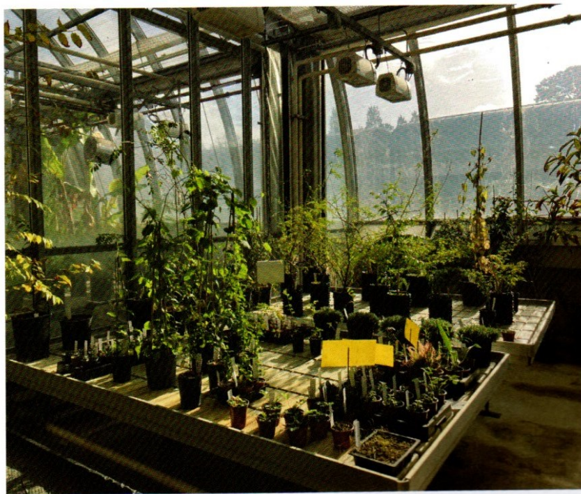
Plants grown from seed stored in the Millennium Seed Bank's vaults inside a nursery on site. Seeds are periodically germinated and planted to test their health or when new seedlings are needed for restoration projects.

Breman says cases like this show the value of so-called ex situ conservation, where a species is kept outside its natural habitat. She also notes that this type of restoration requires substantial planning and forethought. In the aftermath of the fires, emergency funding brought a rare opportunity for large-scale surveys in many areas that scientists had not observed for years. But that also means conservationists are playing catch up instead of collecting seeds long before disaster strikes.